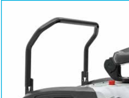
Equipment bar for the attachment of different accessories, e.g. writing desk, working lights.