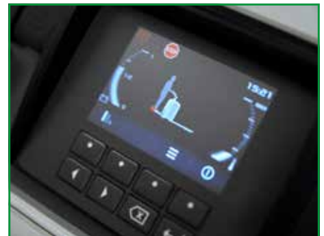
Multifunction display – advanced graphical display with keypad allows operator to interact with display.