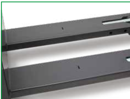
Marking on forks to ensure correct position of pallet.